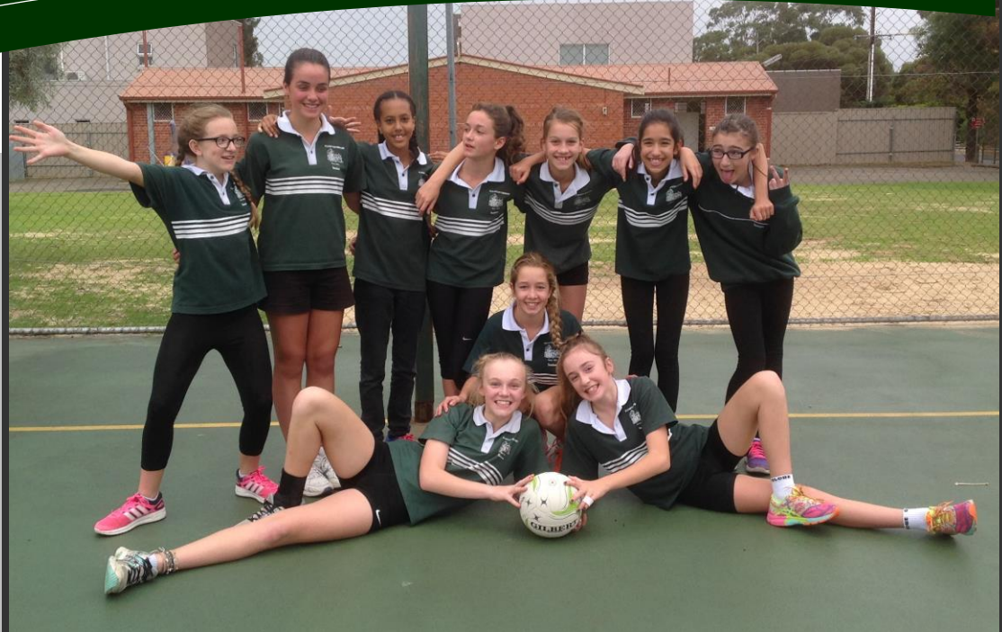
Year 6/7 Girl's Netball Team